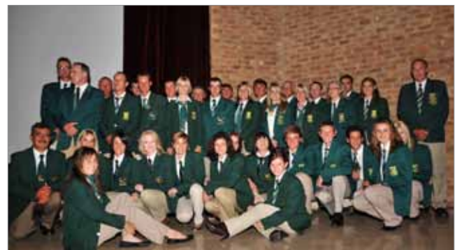
All the S.A. National and ERASA teams with their respective Team Managers.